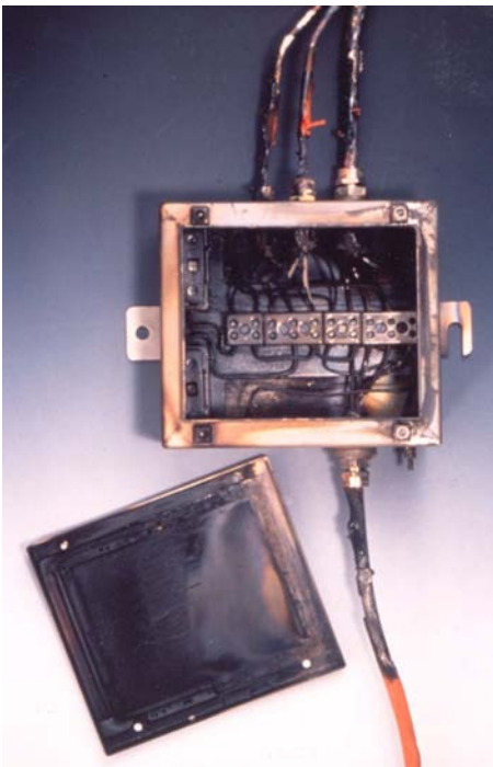
SX Range Enclosure and Cables after IEC331 Fire Testing