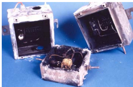
SX and BPG Range Enclosures after BS6387 Testing